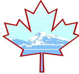
Exhibit Dates —April 28–29, 2003

April 27–30, 2003 Fairmont Hotel Vancouver Vancouver, BC Canada